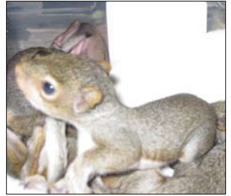
Gray Squirrels 133